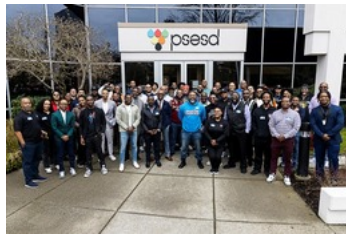
ACE Academy celebrated their 3rd annual Black Male Educator Summit on March 8 at the Puget Sound Educational Service District in Renton.